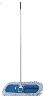
HL544 134 cm HL545 125 cm HL546 127 cm