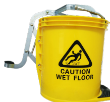
HL543 16 L