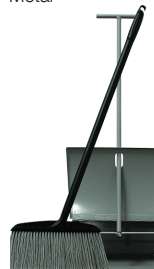
HL542 12 x 17 x 86 cm