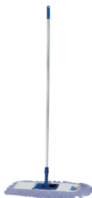
HL547 41 cm HL548 91 cm