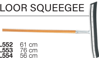
HL552 61 cm HL553 76 cm HL554 56 cm