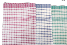
AAT20 45x75 cm