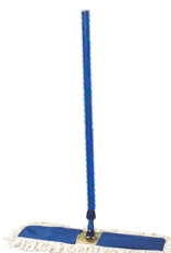
HL549 41 cm HL550 91 cm