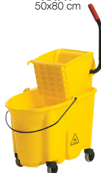
HG79 32 L