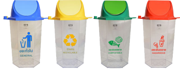
PR16 PR17 PR18 PR19