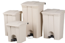
HG126 30.3L 48x38x44 cm HG127 45.4L 40x38x60 cm HG128 87.1L 50x40x84 cm